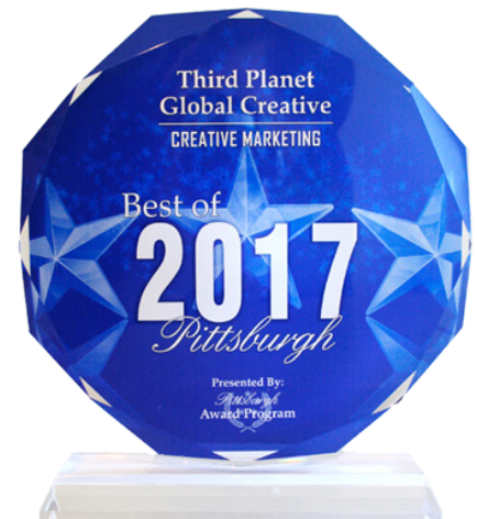
2017 Best of Pittsburgh Award in the Creative Marketing category.