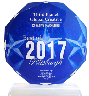
2017 and 2018 Best of Pittsburgh Awards in the Creative Marketing category.